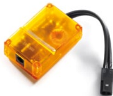
Micro Charger Basic