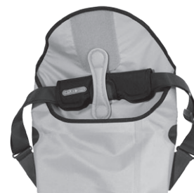
Internal view: fixing of shoulder strap during biking

Eurobike Award 2009 by IF Design and Messe Friedrichshafen, Aug. 2009